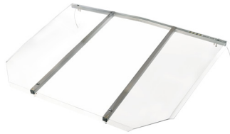
SV4236 Fits span 39"-46"