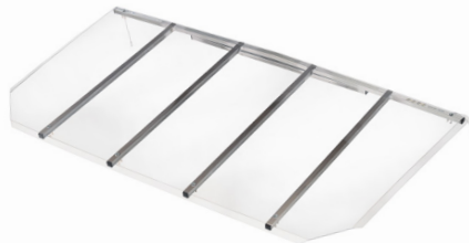
SV6036 Fits span 57"-64"