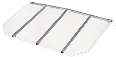
SV5036 Fits span 47"-54"